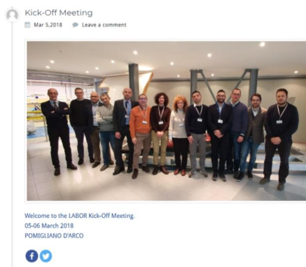
Figure 7 – Article sharing via social media platforms.

To assess the effectiveness of the communication activities the KPI in Table 8 will be adopted.