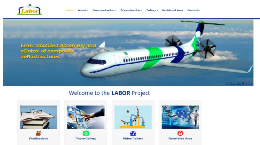
Figure 2 - Home page of the LABOR project web site .

The web site has been issued on Mo3 at the URL https://www.labor-project.eu (Figure 2 shows the home page) as planned.