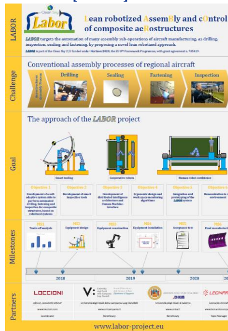
Figure 5 - Poster of the LABOR project (latest version).